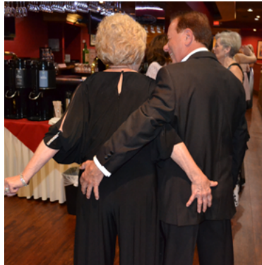
So just what are these two up to? Story on page 22.