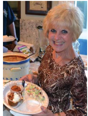
Everyone had a technique for tasting the variety of chilies.