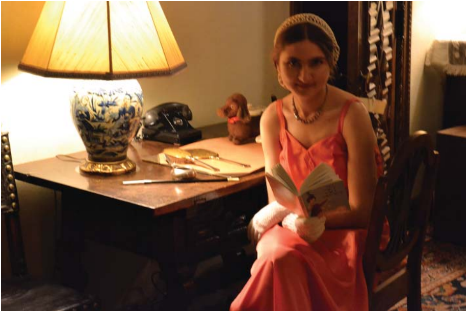
There were many docents dressed in period clothing to add texture to the castle tour.