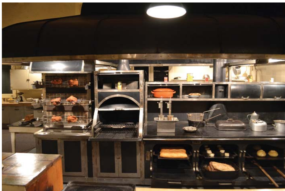
A shot of the vintage kitchen facilities at the castle.