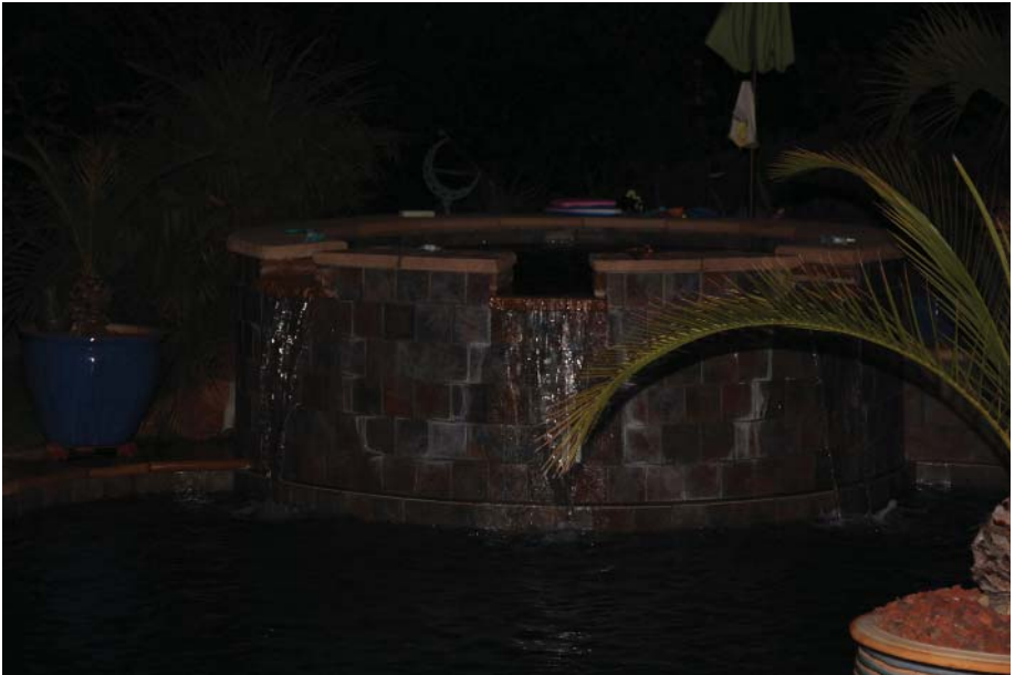
A spa overflowing with beer was a nice, decorative touch.